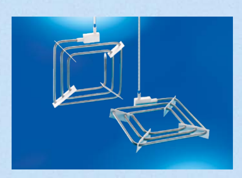
Immersion Heaters Immersion Heaters for controlled heating of aggressive fluids. For applications in Electroplating-, Photovoltaic-, Semiconductor-, Chemical- and Food Industry.