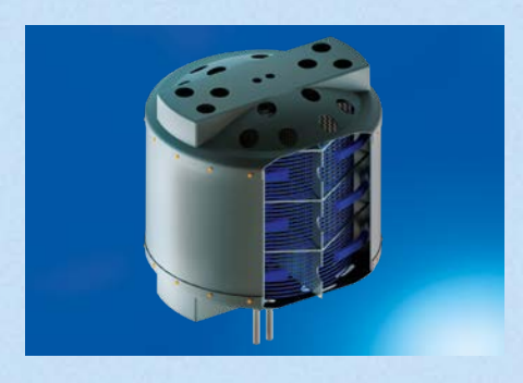
ThermoGenius™ Water Water heat exchanger for the extraction of geothermal energy from surface waters.