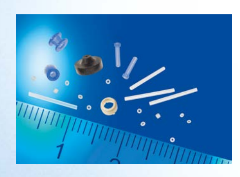
Precision Parts Machined or injection molded micro components with diameters less than 0.5 mm and wall thicknesses of a few hundredths of a millimetre for electro-medical devices, short-term implants and other applications.