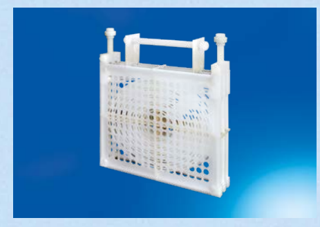
Thermo-X<sup>TM</sup> Heat Exchangers Plastic heat exchangers, chemical and corrosion resistant made from Moldflon<sup>TM</sup> PFA, PVDF, PP or PE in various designs. For applications in Electroplating-, Photovoltaic-, Semiconductor- and Chemical Industry.